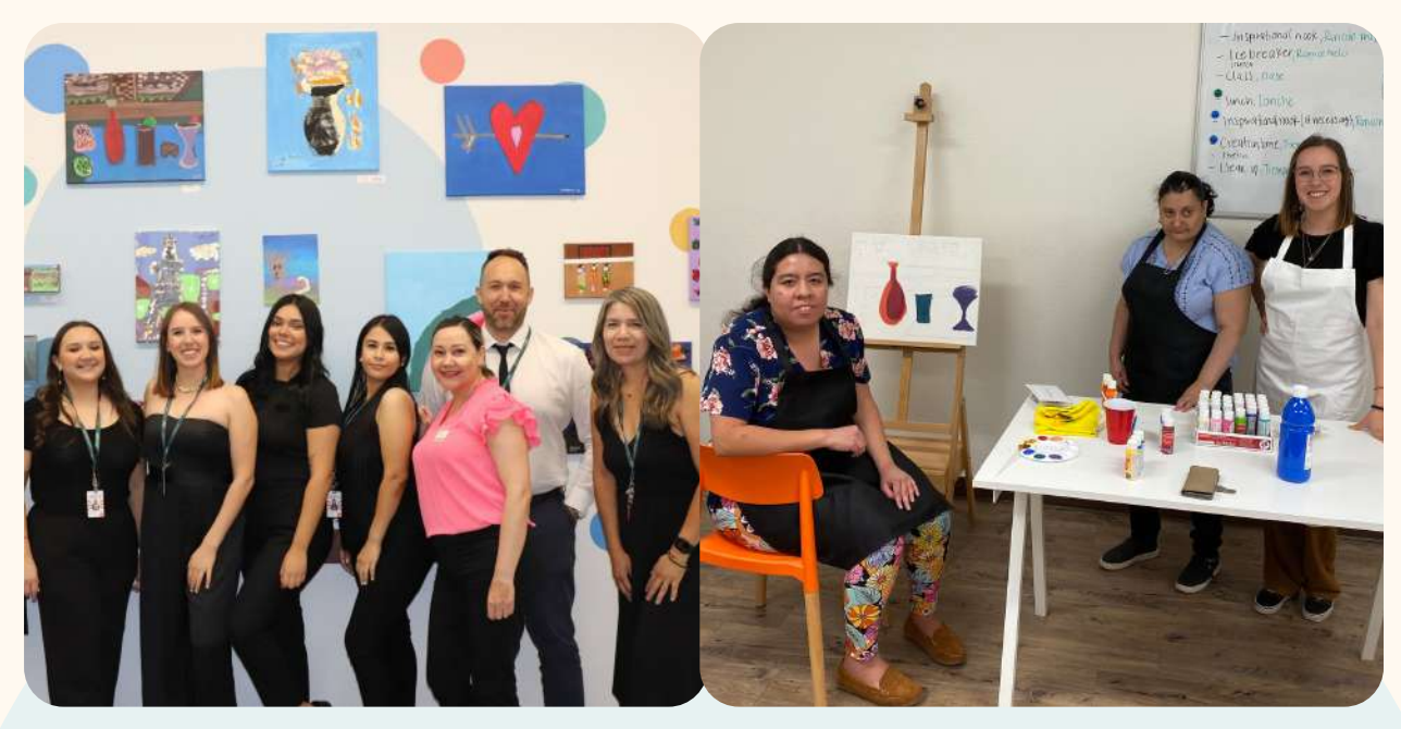
Authentic Relationships Through Creative Expression!

To learn more about Arte - Adjoin and its purpose to aid in fostering creative expression, building confidence, and creating authentic relationships around the appreciation of art, follow us on social media and visit our new inclusive art workspace in Imperial Valley. Together, let's embark on this journey of artistic exploration and collaboration, shaping a more inclusive and vibrant community.