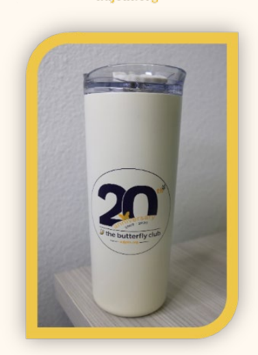
BFC 20th Anniversary Tumbler & Sticker Set