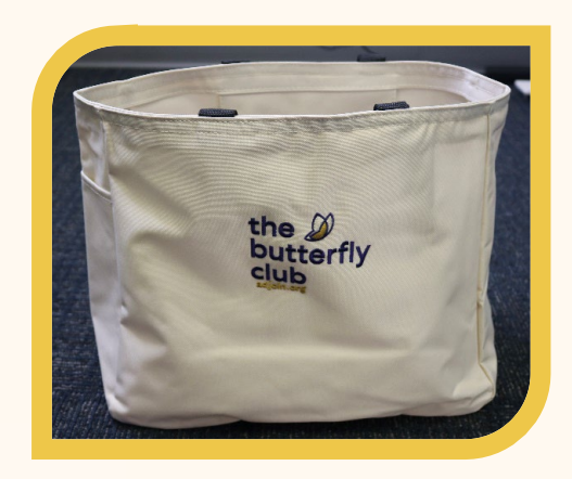
BFC Tote Bag