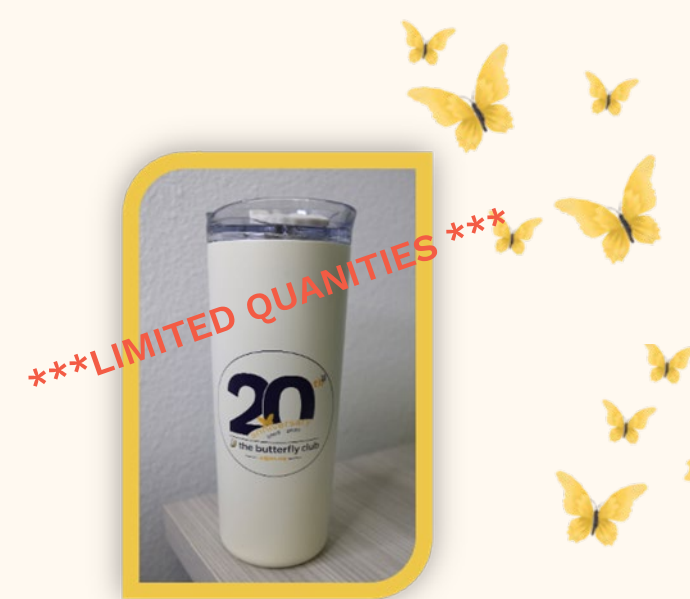
BFC 20th Anniversary Tumbler & Sticker Set