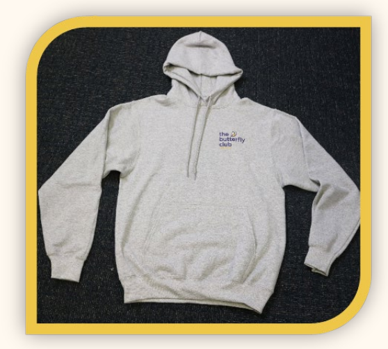
BFC Hooded Sweatshirt