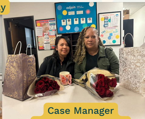
Case Manager Appreciation Week!