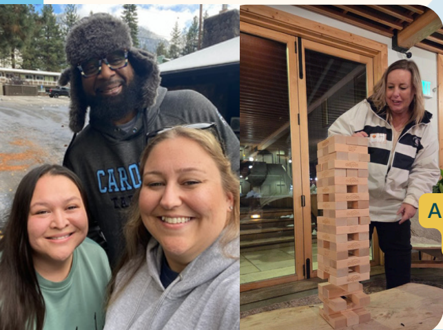
Adjoin's 2025 Management Retreat in Lake Tahoe!