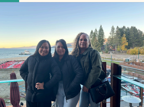
Adjoin's 2025 Management Retreat in Lake Tahoe!