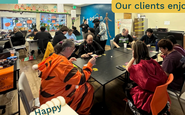
Our clients enjoyed a Halloween Social in the ARTE office!