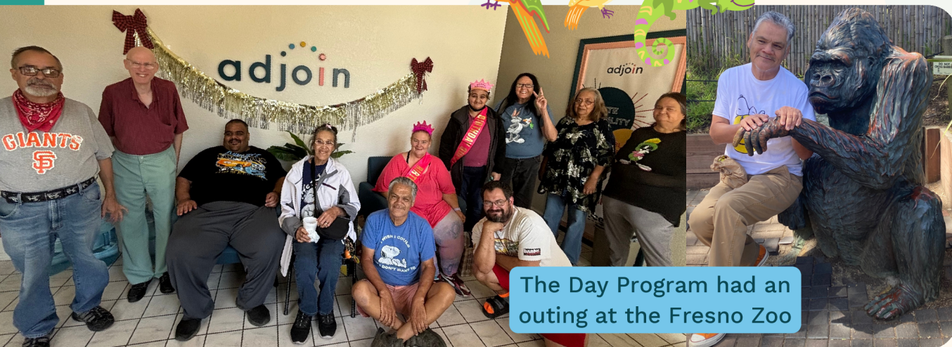
The Day Program had an outing at the Fresno Zoo